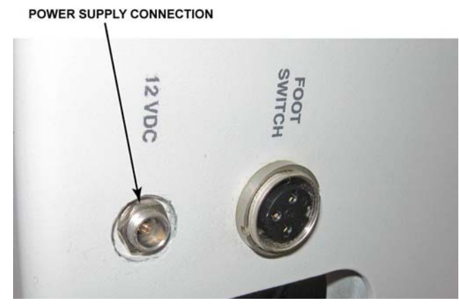
Figure 3: E-DWT rear view detail: power supply connection

• Locate the 12V power supply connection on the rear housing of the E-DWT. This connection and the internal cable will be replaced. (See Figure 3)