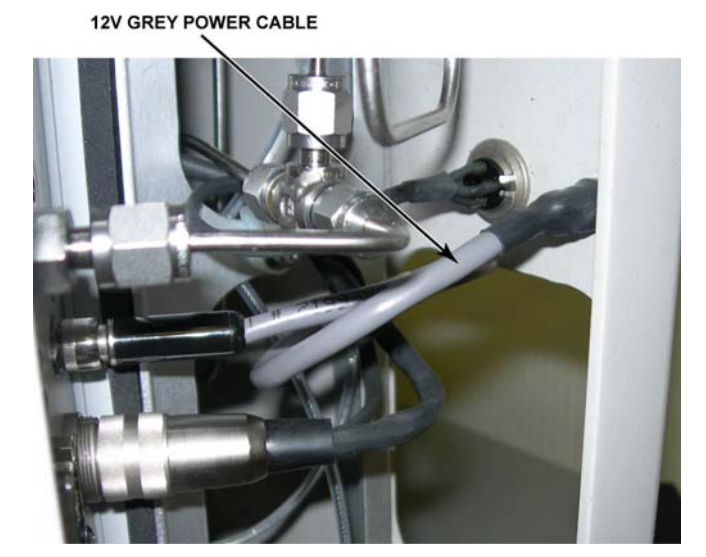
Figure 4: E-DWT internal view detail: 12V grey power cable

• Locate the internal 12V cable that connects to the RPM4 (see Figure 4).