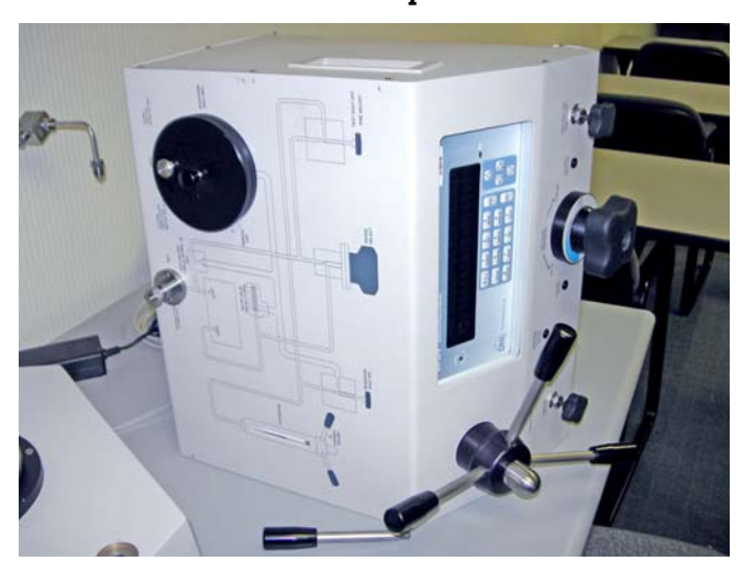
Figure 2: E-DWT on its side with one handle removed

• Remove one of the four variable volume handles to allow the E-DWT to be placed on its side.